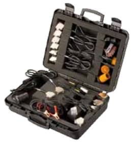
Carrying case with European vehicle cables