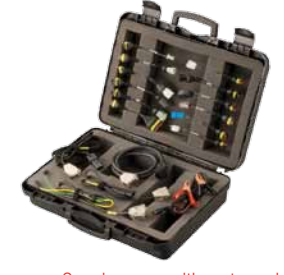
Carrying case with motorcycle cables