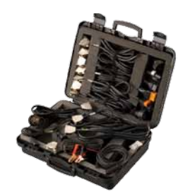
Carrying case with Truck cables basic